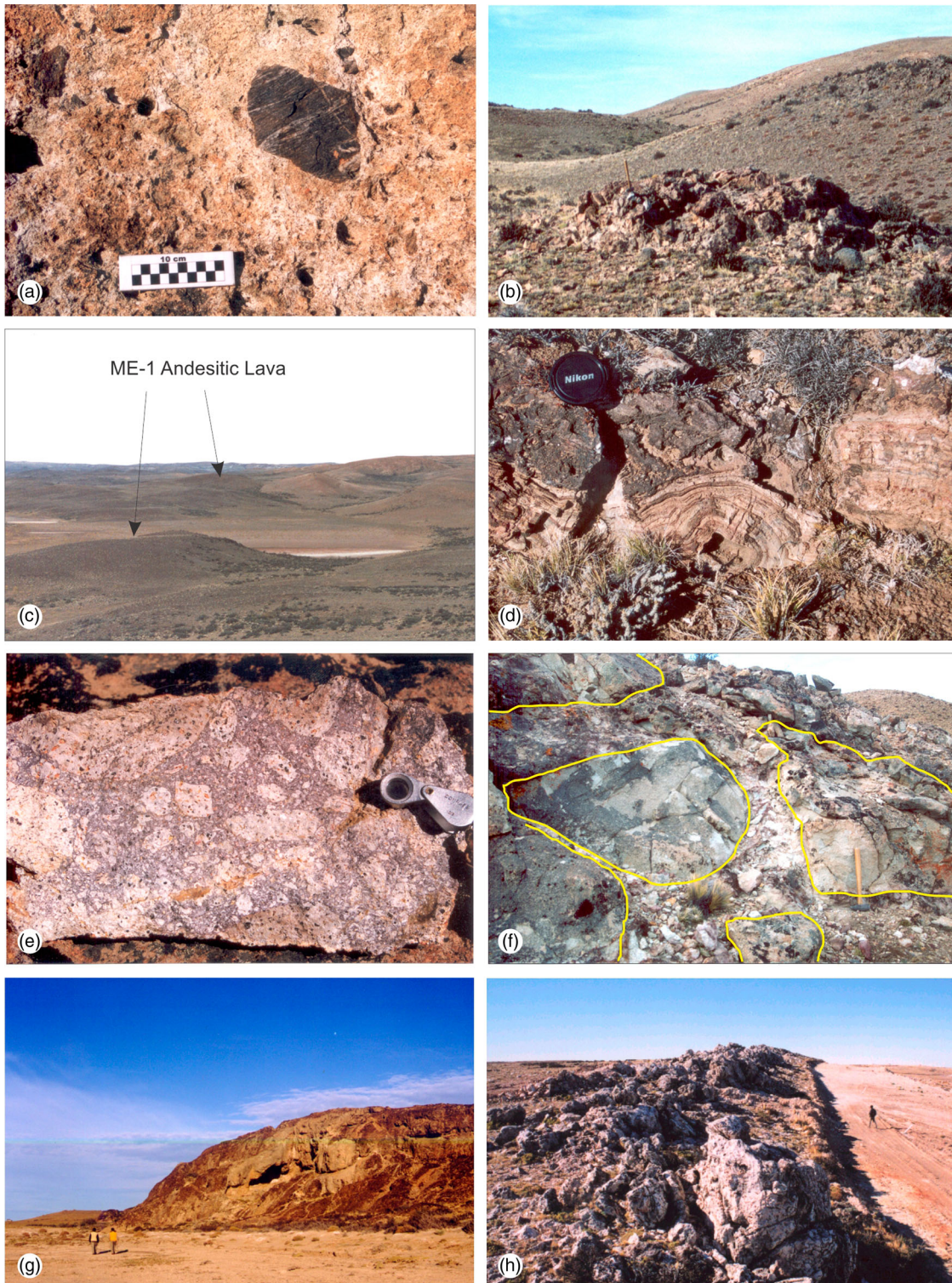
Figure 3. (a) Sub-angular fragment of biotitic-quartz schist in proximal facies of ME-2 Rhyolitic Ignimbrite. (b) Granite basement outcrop. (c) ME-1 Andesitic Lava flow making a topographic low in the western area of the district. (d) Banded travertine displaying stromatolitic growth. (e) Autobrecciated lava with variable sized fragments in a re-crystallized glass matrix and phenocrysts. (f) Clast-propped phreatomagmatic breccia with large sub-angular lava blocks in proximal zone (clasts outlined in photograph). (g) Panoramic view of an ME-5 Rhyolitic Ignimbrite outcrop, forming a flow more than 20 m thick with large erosion caves. (h) Panoramic view from west of the central area of Vein María. The thickness, over 5 m in this area, can be appreciated in the foreground. To the right, atop the structure, a level portion of the ground is seen, where short exploration holes were drilled.

approximately 1800 ha. The following deposits comprise at least five ignimbrite units, ME-4, 5 (Figure 3(g)), 6, 7, and 8 Rhyolitic Ignimbrites, whose temporal relationships are not clear because of the lack of stratigraphic contacts. The ignimbrites are mostly of high grade