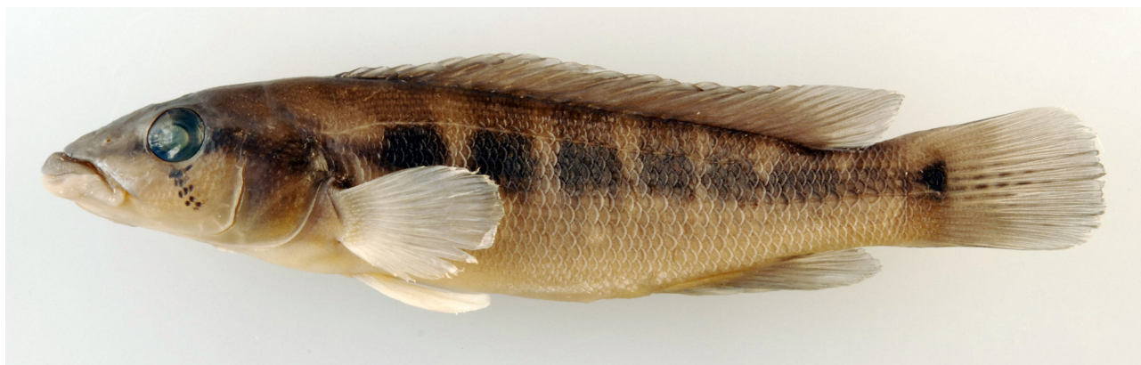
FIGURE 1. Crenicichla taikyra , holotype, MACN-ict 9461, 98.3 mm, Argentina, Misiones province, río Paraná at Candelaria.

Crenicichla taikyra differs from C. jurubi in having a serrated vs. smooth preopercle, a well developed suborbital stripe vs. suborbital stripe absent or reduced to a spot at margin of orbit, and by the absence vs. presence of scattered dots on back and sides. Crenicichla taikyra differs from C. semifasciata in having an ascending arm of the premaxilla longer (vs. shorter than the dentigerous one), caudal fins subtruncated (vs. deeply rounded), caudal fin scaled only on its basal third (vs. mostly scaled), caudal spot without light ring (vs. caudal spot surrounded by a silvery or orange ring), and a narrower interorbital width (17.1–23.3% vs. 32.0–40.0% of HL). Finally, Crenicichla taikyra can be distinguished from C. yaha by having a stouter lower pharyngeal tooth plate with about 16 molariform teeth (Fig. 2a) (vs. about 4 molariform teeth; Fig. 2b), and absence of microbranchiospines on gill arches (vs. presence).