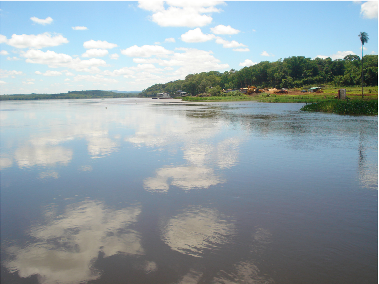
FIGURE 5. Río Paraná at Candelaria, type locality of Crenicichla taikyra .