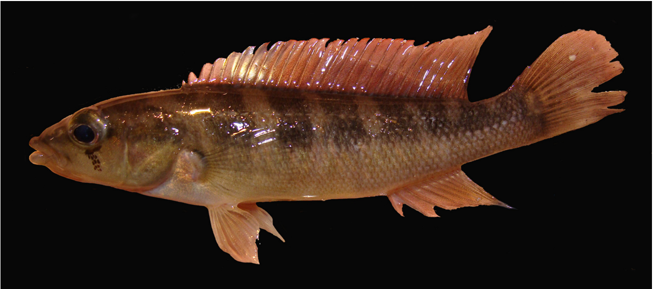
FIGURE 3. Crenicichla taikyra , paratype, live specimen, MACN-ict 9466, 74.9 mm, Argentina, Corrientes province, Ituzaingo city.

Colour upon capture. Colours not greatly different from coloration in alcohol, background of body pale gray or olive green (Fig. 3). Dorsal, anal, and caudal fins pale gray or olive green. Pectoral fin hyaline, pelvic fin pale gray.