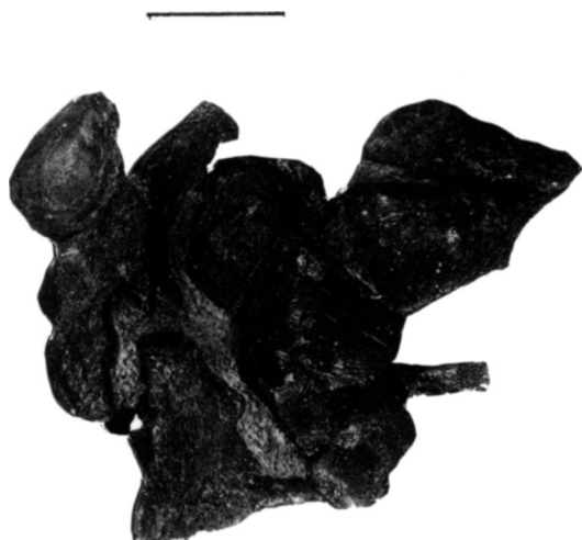
FIGURE 2. Ophthalmosauria indet. (MNHNH-P 3068). Lateral view. Scale bar=5 cm.

Figs. 2A–C). Based on the characteristics of the basioccipital, the MNHNH-P 3068 can now be referred to the Ophthalmosauria .