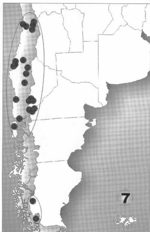
Figs. 7. Megachile (Dasymegachile) semirufa , geographic distribution (it includes references of the material studied and others records cited in the literature).

convex and pilose. Apical rim slightly arcuate. S6. Pregradular area well separated, quadrate, apical margin sinuate and pilose, with scarce hairy. Pubescence of postgradular area composed of lateral patch of simple setae, separate medially. Apical rim with conspicuous lateral lobes and straight medially. S7. Absent. S8. Apical lobe with distal margin bilobate, lateral margin straight and pilose (2-4 setae); surface subapically covered with fine and long hairs; basal margin acute. Genitalia (Fig. 6). Gonobase wider than long, basal margin concave medially. Gonoforceps slightly subcylindrical, with basal projection, inner surface hairy, apex simple, lanceolate and asymmetric, with subterminal brush of setae, their length not exceeding penis valve length. Penis valve flattened laterally; penis valve bridge subrectangular, superior margin arcuate and inferior margin straight. Volsella scarcely developed, acute.