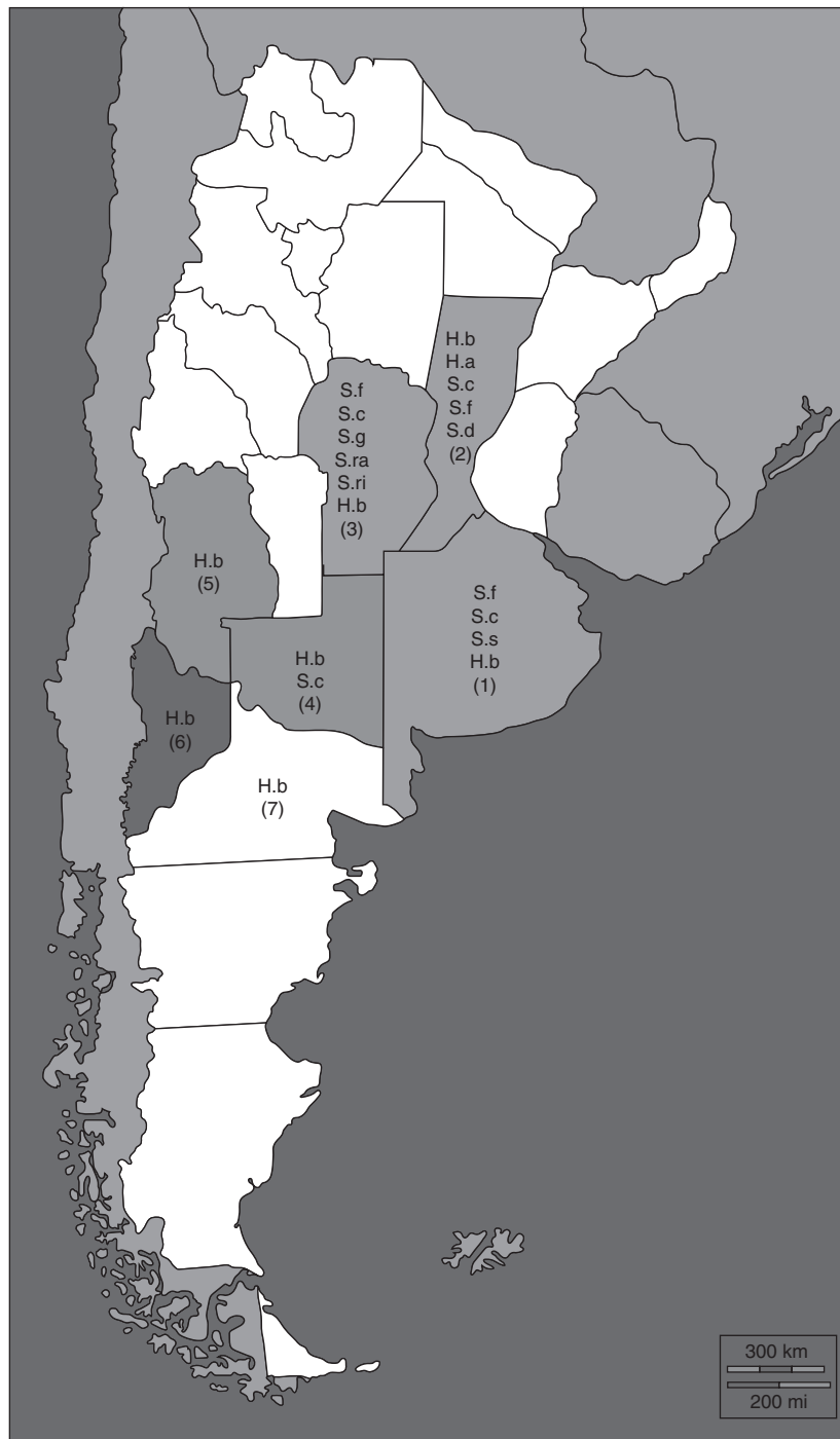
Fig. 16.2. Entomopathogenic nematodes from provinces of Argentina. 1 = Buenos Aires; 2 = Santa Fe; 3 = Córdoba; 4 = La Pampa; 5 = Mendoza; 6 = Neuquen; 7 = Rio Negro. H.a = Heterorhabditis argentinensis ; H.b = Heterorhabditis bacteriophora ; S.c = Steinernema carpocapsae ; S.d = Steinernema diaprepesi ; S.f = Steinernema feltiae ; S.g = Steinernema glaseri ; S.ra = Steinernema rarum ; S.ri = Steinernema ritteri ; S.s = Steinernema scapterisci .