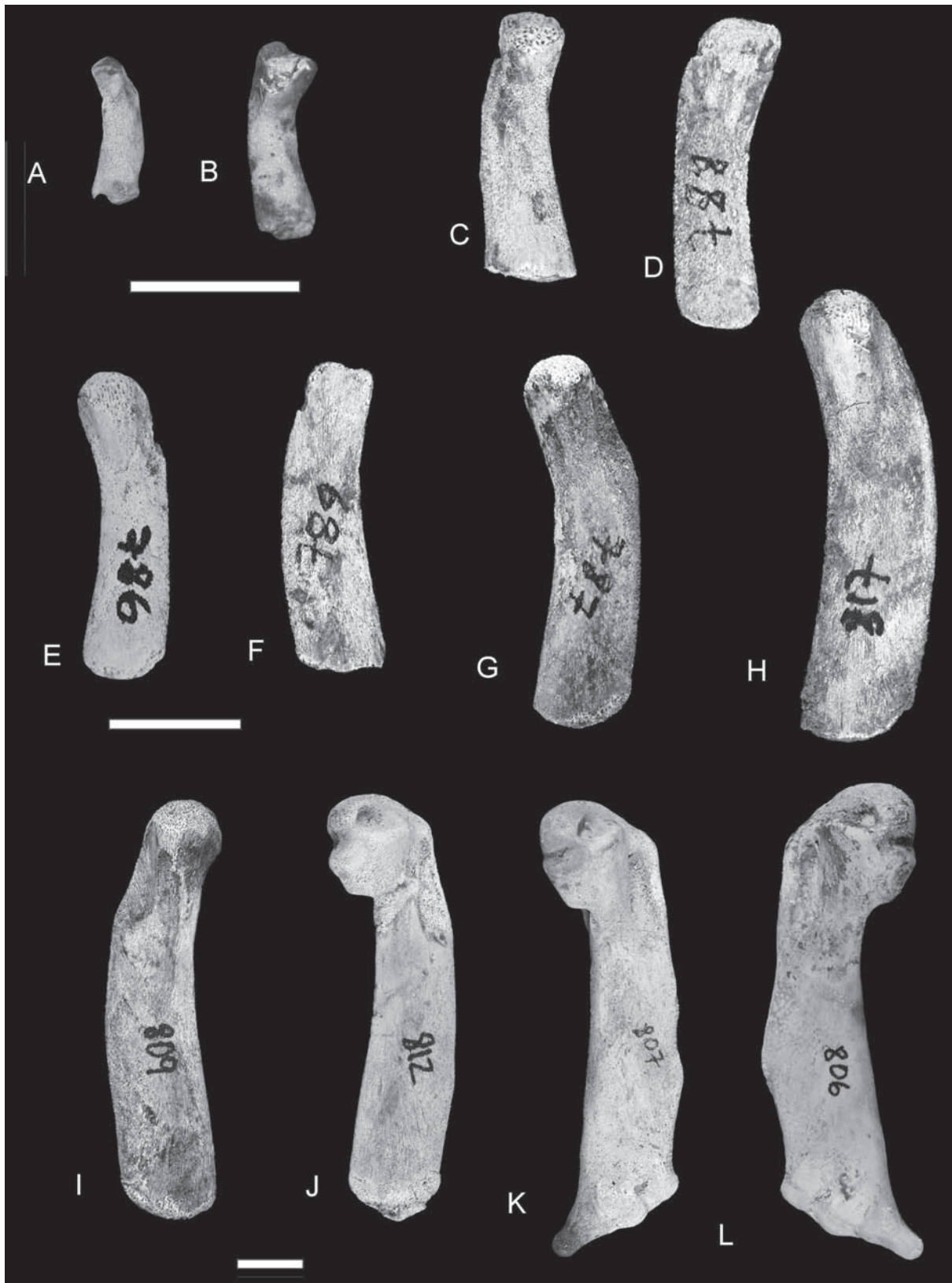
Fig. 3. Ontogenetic series constituted by Pygoscelis antarctica . A , MLP 1769 (newborn), B , MLP 790 (7 days old), C , MLP 805 (10 days old), D , MLP 788 (2 weeks old), E , MLP 786 (2 weeks old), F , MLP 787 (4 weeks old), G , MLP 817 (5 weeks old), H , MLP 809 (6 weeks old), I , MLP 812 (8 weeks old), J , MLP 807 (ten months old), K , MLP 806 (1 year old). Each line of photographs has its own scale. Scale bar = 10 mm.