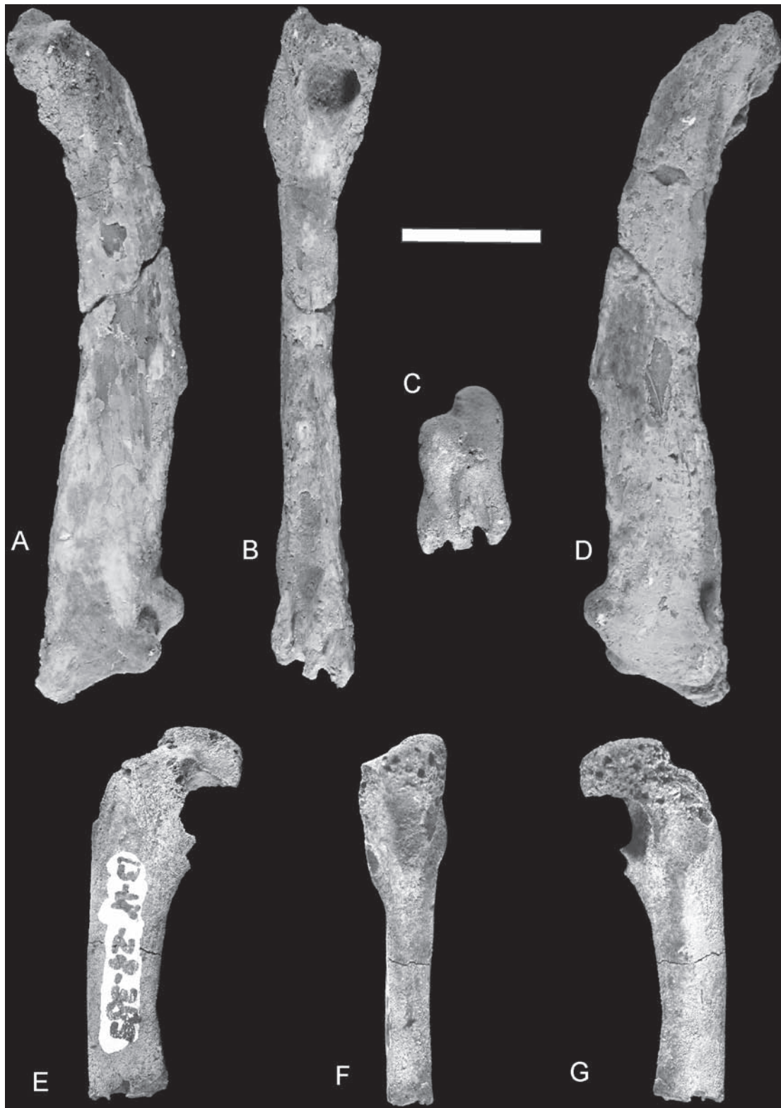
Fig. 4. A-D – Apros dokitos mikrotero , MLP 00-I-1-19 (holotype, left humerus) A, cranial, B, medial, C, distal, and D, caudal views. E-G – Spheniscidae indet., MLP 13-IX-28-385 (right humerus) E, cranial, F, medial, and G, caudal views. Ammonium chloride powder was sublimated for fossil whitening. Scale bar = 10 mm.