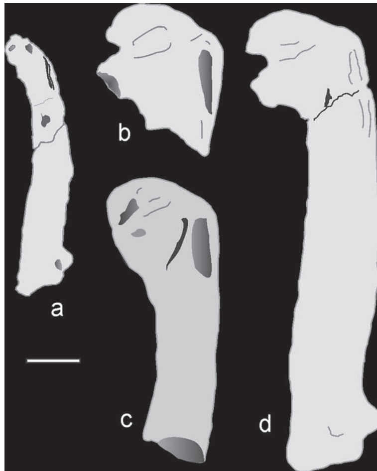
Fig. 5. Comparative scheme of: A , Apros dokitos mikrotero MLP 00-I-1-19 and materials assigned genera of small-sized penguins: Delphinornis sp. and/or Mesetaornis polaris and/or Marambiornis exilis by JADWISZCZAK (2006: fig. 19, table 4); B , IB/P/B-0398 (mirrored image), C , IB/P/B-0132, D , IB/P/B-0382 (mirrored image). Images B, C, and D were taken from JADWISZCZAK (2006) and re-drawn with his permission. Scale bar = 10 mm.

MLP 00-I-1-19 (MLP 13-IX-28-385 is broken in this region). The major differences with respect to previously described materials seem to be related to size and robustness. Both materials described here are extremely small and slender, with weak, compressed and barely sigmoid shafts.