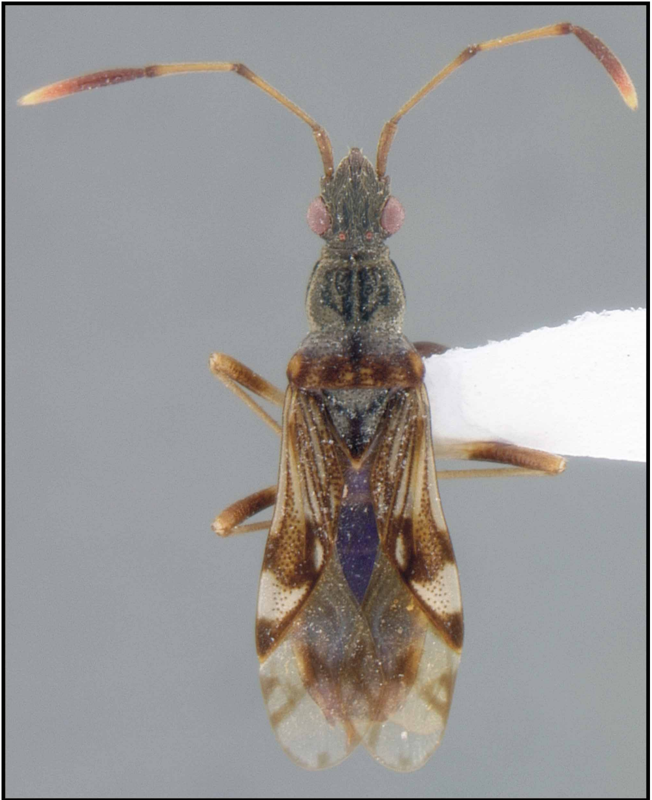
FIGURE 1. Villalobosothignus erwini n. sp., habitus, female.

Size: Length of holotype 7.8 mm; range of paratypes measured 7.25–7.95 mm (see Table 1 for other measurements).